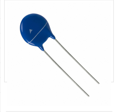
Image shown is a representation only. Exact specifications should be obtained from the product data sheet.