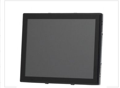
Image shown is a representation only. Exact specifications should be obtained from the product data sheet.