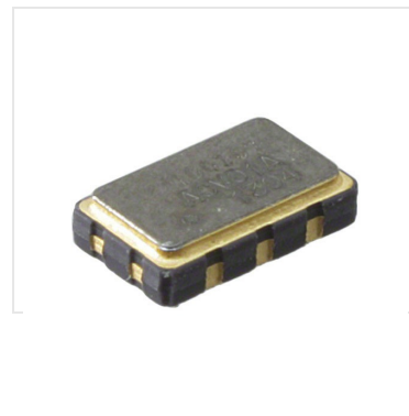
Image shown is a representation only. Exact specifications should be obtained from the product data sheet.