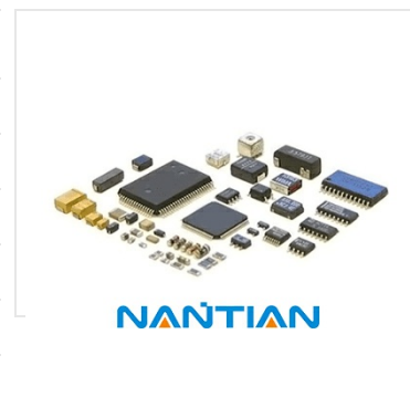
Image shown is a representation only. Exact specifications should be obtained from the product data sheet.