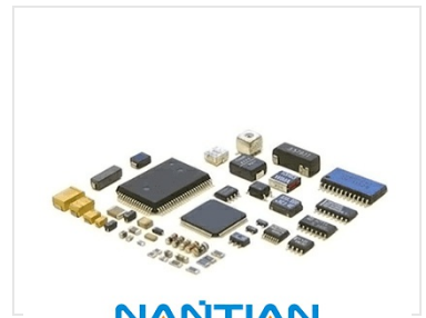
Image shown is a representation only. Exact specifications should be obtained from the product data sheet.