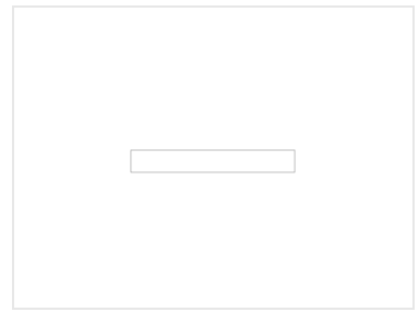
Image shown is a representation only. Exact specifications should be obtained from the product data sheet.