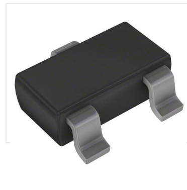
Image shown is a representation only. Exact specifications should be obtained from the product data sheet.