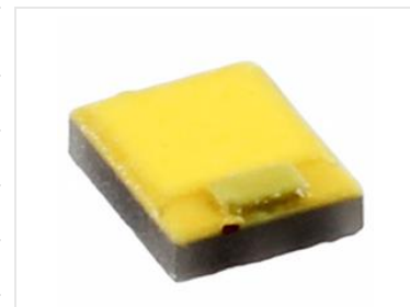
Image shown is a representation only. Exact specifications should be obtained from the product data sheet.