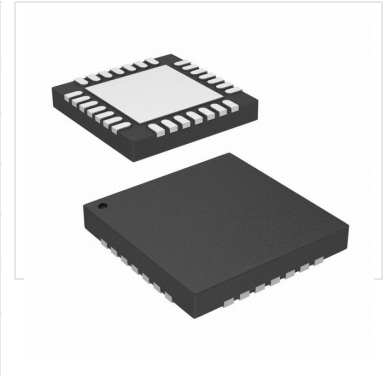
Image shown is a representation only. Exact specifications should be obtained from the product data sheet.