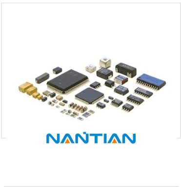
Image shown is a representation only. Exact specifications should be obtained from the product data sheet.