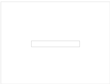
Image shown is a representation only. Exact specifications should be obtained from the product data sheet.