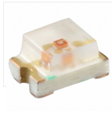
Image shown is a representation only. Exact specifications should be obtained from the product data sheet.