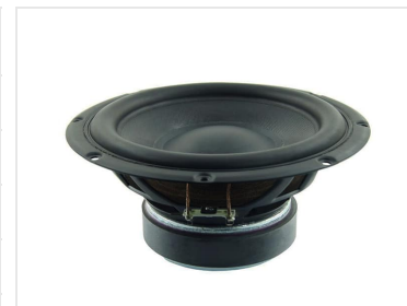
Image shown is a representation only. Exact specifications should be obtained from the product data sheet.