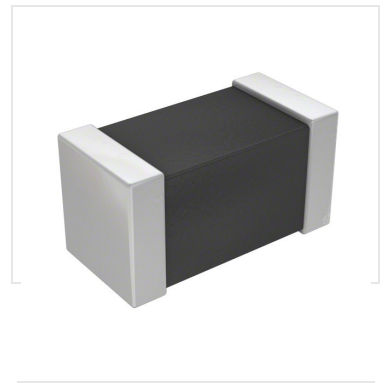
Image shown is a representation only. Exact specifications should be obtained from the product data sheet.