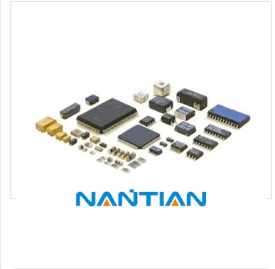
Image shown is a representation only. Exact specifications should be obtained from the product data sheet.