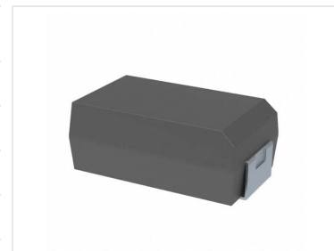
Image shown is a representation only. Exact specifications should be obtained from the product data sheet.